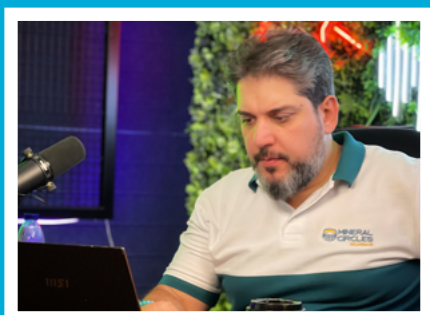
Wiki Bearings Podcast Mineral Circles Bearings