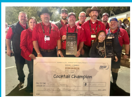
A Winning Charity Cocktail EBT Bearings